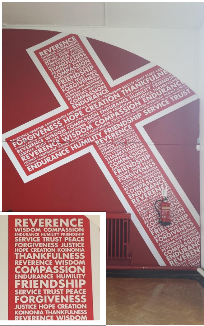
Our Christian gifts cross in the Main Hall.

Many of these gifts have overlaps with the values of other faiths, and, where we can make links from other traditions, we do. At the same time we have a distinctively Christian approach to these gifts / values which is influenced by the emphasis we put on the person of Jesus.